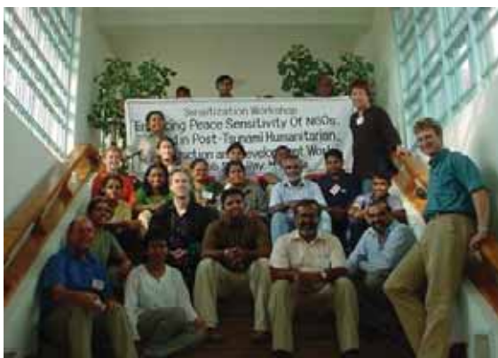
Peace sensitivity workshop for NGOs, post-tsunami period, 2005

In collaboration with CHA and DWG, the Foundation convened a small expert meeting on the issue of 'conflict sensitivity in the tsunami response'. The meeting took place in January 2005 and included the following participants: Sarvodaya, the Marga Institute, MWRAF, IMCAP, FCE, CPA, CHA, TRO, SSA, SAPNA, USAID, ADB, WB, SIDA, the Embassy of The Netherlands, UNDP, DFID, FLICT, GTZ, the Embassy of Switzerland, the British High Commission, NORAD, CIDA, VSO, UNICEF and the Berghof Foundation. Other meetings followed throughout January and February. In the course of these, annotations to the Code of Conduct of the International Federation of Red Cross and Red Crescent Societies and other NGOs involved in the disaster-response programmes of IFRC were identified as a useful first step towards an internationally-accepted standard for humanitarian assistance.