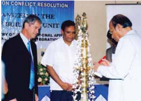
Mr. Roelf Meyer, Chief Negotiator of the African National Congress and former Minister of Defence and Constitutional Affairs, Mr. Ebrahim Ebrahim, Executive Committee member of the African National Congress and an advisor to the Deputy President of South Africa and Hon. D.E.W Gunasekara, Minister of Constitutional Affairs and National Integration, lighting the traditional lamp before the commencement of the workshop

With the deterioration of the peace process in 2006, capacity-building work with stakeholders became more and more difficult. In particular, Berghof's preferred method of bringing together representatives from all political stakeholder groups had to be abandoned. We had to accept that, for the time being, this work would have to be sustained mainly by engaging separately and in parallel with the different stakeholders. To ensure that sustainable structures could be created for future peace initiatives through this work, we encouraged our partners either to strengthen their existing peace-related organizations or to establish new ones for this purpose.