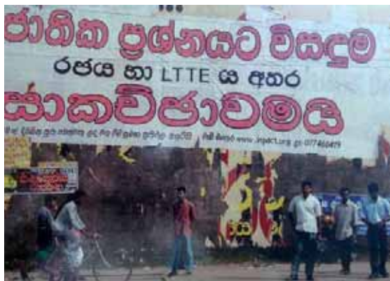
'Dialogue is the only solution to the national problem' – derived from a people's survey by INPACT

These events marked the end of a process that had begun with the CFA and been officially kept alive in the hope that at some stage it might produce an interim political agreement – a means whereby it would be possible to move on from ‘normalization’ to the negotiation of a final settlement. It also marked the end of optimism. From this point onward, the relationship between the main negotiating parties deteriorated significantly, while the international environment also changed for the worse. The assassination of Foreign Minister Lakshman Kadirgamar led to the proscribing of the LTTE by the EU; the LTTE responded to this move by restricting SLMM participation to nationals of the only two non-EU countries in the monitoring group, Norway and Iceland.