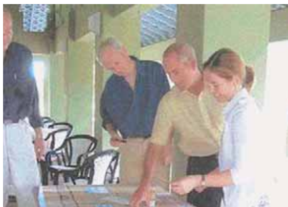
A workshop on the Sri Lankan peace process for the Donor Working Group (DWG), 2004

Subsequently, the work undertaken by the Foundation and its partners on this subject generated requests from the donor community, particularly those termed 'like-minded donors' (British, Canadian, Dutch, German, Norwegian, Swiss and Swedish), for the development of a conflict-sensitive approach to development assistance. In June 2004, in association with the Netherlands' Clingendael Institute, Berghof facilitated a workshop on the Sri Lanka peace process for the Donor Working Group (DWG). The purpose of this workshop was to develop scenarios on the future of the peace process. It was intended as a follow-up to the Tokyo Donor Conference, where the DWG had taken a principled, supportive stand on the Sri Lankan conflict, linking the provision of development aid to the peace process.