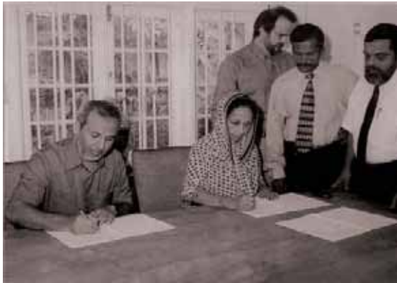
Signing of the MOU between SLMC and NUA to establish the Peace Secretariat for Muslims, December 2004

The international seminar on ‘Envisioning New Trajectories for Peace in Sri Lanka’, which took place in April 2006 in Zurich was the last comprehensive unofficial effort to bring together key representatives from civil society, scholars and academics from all communities (in the presence of several conflict-transformation experts from the international community). The seminar was co-facilitated by the Centre for Just Peace and Democracy (CJPD), a policy think-tank of Tamil intellectuals and leading activists from the Tamil diaspora. The participation of certain individuals close to the Government of Sri Lanka had been endorsed by the Government. The seminar was held at a moment when, after the first Geneva talks in February 2006, there was still hope that a new peace initiative might be possible.