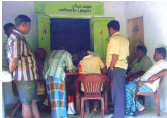
Dissemination of knowledge into the regions

To ensure the availability of resources for exploring these multiple futures, Berghof promoted research and development on educational and reference materials covering related issues. Research into fiscal devolution under the Thirteenth Amendment to the Constitution and comparative studies on Provincial Councils were undertaken by our partners. A project was also begun to create an index of books, articles and periodicals on power-sharing in Sri Lanka.