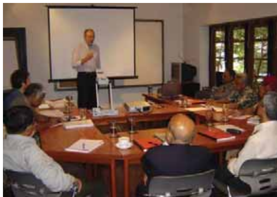
Preparatory seminars in Colombo for the competency development programme conducted at Hamdard University, India