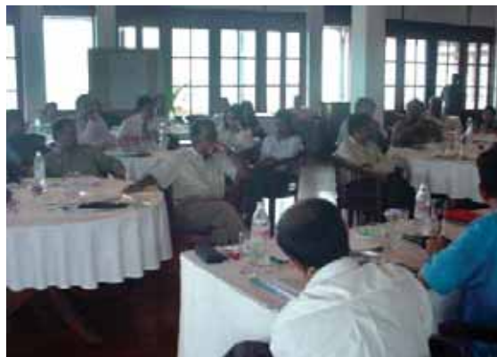
The dialogue series, 'State Reform, Conflict Transformation and the Transition to Peace in Sri Lanka', in collaboration with SSA, 2004

At the beginning of 2004, the Social Scientists' Association (SSA) and the Berghof Foundation began a process of collaboration that looked more closely at some of the issues pertaining to state reform in Sri Lanka. The project was titled 'State Reform, Conflict Transformation and the Transition to Peace in Sri Lanka'.