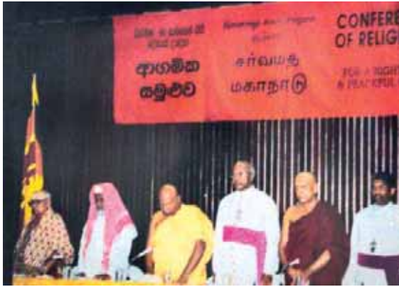
A united multireligious community

Reconciliation between opposed parties in the Sri Lankan conflict has been a priority of the Berghof Foundation since its inception. It stems from recognition of the importance of the concept of reconciliation within the conflict-transformation process, as well as from a keen appreciation of the shortfalls that exist with respect to its application in ways that are contextually relevant, politically sensitive and culturally appropriate to the Sri Lankan situation.