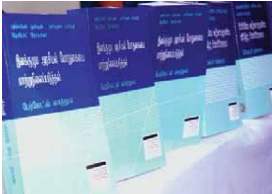
Translations of the Berghof Handbook in Sinhala & Tamil

The unit facilitated the translation of the Berghof Handbook into Sinhala and Tamil. The Handbook was originally produced with the objective of generating creative responses to some contemporary challenges in conflict transformation. Even though the task of translating such an extensive piece of literature proved to be challenging, it was embarked upon in view of the strong demand for such knowledge in Sinhala and Tamil. It is perhaps the first such comprehensive publication available in these two languages. A trilingual, updatable glossary on terminology used in conflict transformation was also made available on the Foundation's web site, www.berghof-foundation.lk .