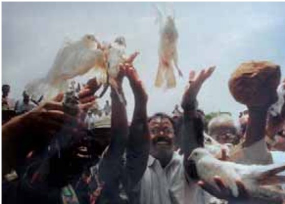
A landmark event of the peace process – opening of the A9 highway

The first of these was the incompatible ideas held by the two sides with respect to what ‘normalization’ actually meant. For the GoSL it meant primarily an end to violence, the opening of the A9 highway, removal of checkpoints, lifting the embargo on goods and the liberalization of many other regulations. The LTTE and many Tamils expected more; that, beyond these measures, displaced persons and others who had suffered most from the war should have the opportunity to return to their houses and resume their normal lives. This difference was difficult to overcome because, as long as there was no substantive demilitarization on both sides, the GoSL was not prepared to offer any substantive reduction of the High Security Zones or its military presence in the North, while the LTTE argued that without any significant improvement in the lives of the IDPs, normalization would be meaningless.