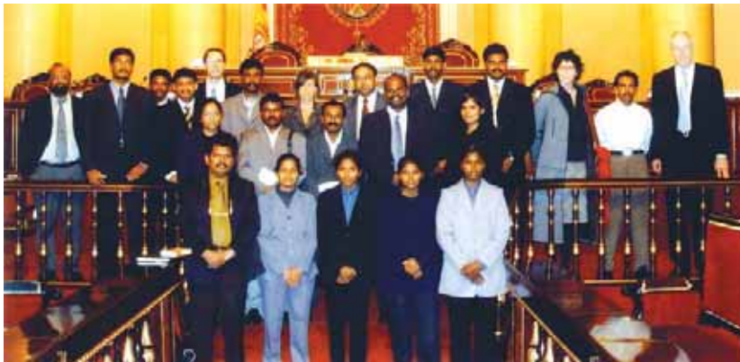
Study tour for the LTTE's political affairs committee in the upper house of the Spanish Senate, 2003

In April/May 2003, the Foundation facilitated a study tour for members of the LTTE's Political Affairs Committee to four countries where federal or quasi-federal arrangements are in operation: Germany, Belgium, Switzerland and Spain. The Foundation had been encouraged by the Government of Sri Lanka and the Norwegian facilitators of the peace negotiations to organize such a tour.