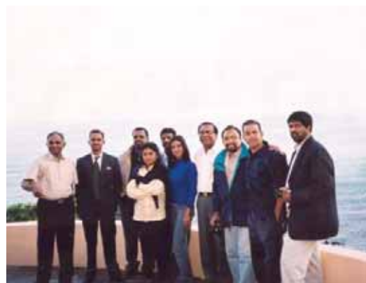
The study tour to South Africa for a constitutional lawyers from Sri Lanka, 2003

South Africa was chosen because of the broad range of experiences it offered, both in negotiating peace and in constitution-making. South Africa also provided a large pool of resource persons with whom the group met.