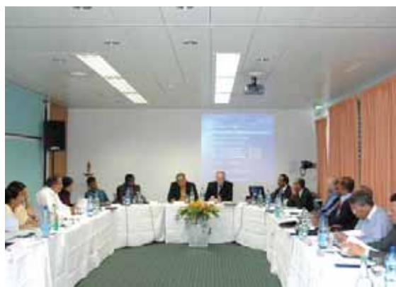
The international seminar on ‘Envisioning New Trajectories for Peace in Sri Lanka’ facilitated jointly with the Centre for Just Peace and Democracy (CJPD), April 2006 in Switzerland