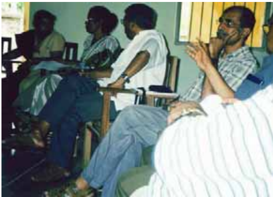
Dialogue workshop on conflict transformation in Sri Lanka, Jaffna, 2003

‘Problem-solving workshops’ were perhaps the most direct form of interactive engagement practised by the Berghof Foundation. In them, we brought together various, often opposed stakeholders in one room to discuss common issues. We did this in partnership with government Ministries, the LTTE and affiliated organizations, political-party offices and local non-governmental organizations. During 2002-2005, when there was still an official peace process ongoing though communication between different parties was weak, we worked to bring academics, political advisors, religious leaders and civil-society leaders together to discuss common issues. We helped them develop a common language for discussing these issues, promoted mutual understanding and supported joint analyses and other collaborative activities.