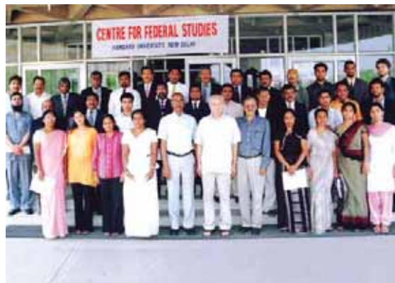
Faculty members and Sri Lankan participants at the Centre for Federal Studies, University of Hamdard, New Delhi, 2006