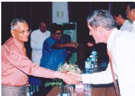
Learning of global experiences through international experts: Hon. G.L Pieris and Mr. Roelf Meyer

Whenever we invited international experts to visit Sri Lanka, we tried to make the best possible use of their expertise by holding workshops or seminars for our staff and partner-organization representatives. We also made it a point to re-invite experts to Sri Lanka as regularly as possible, since this makes ongoing interaction possible and creates an atmosphere of trust – two essential requisites for learning and open-minded discussion. In recent years, some of these consultants have become programme associates or become involved in the work of the Berghof Foundation outside Sri Lanka.