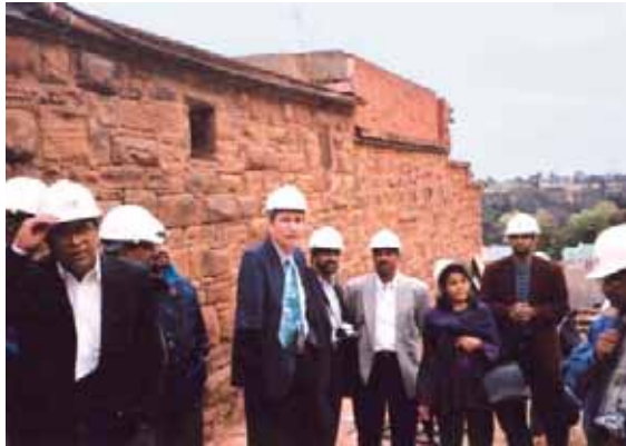
The Sri Lankan Study Group with Albie Sachs at the then being constructed constitutional court which was an old apartheid prison site, South Africa, 2003

In September 2003, the Foundation organized a study tour to South Africa for a group of ten constitutional lawyers from Sri Lanka. They were accompanied by two lawyers from the Berghof Foundation. The purpose of the tour was to provide opportunities for: