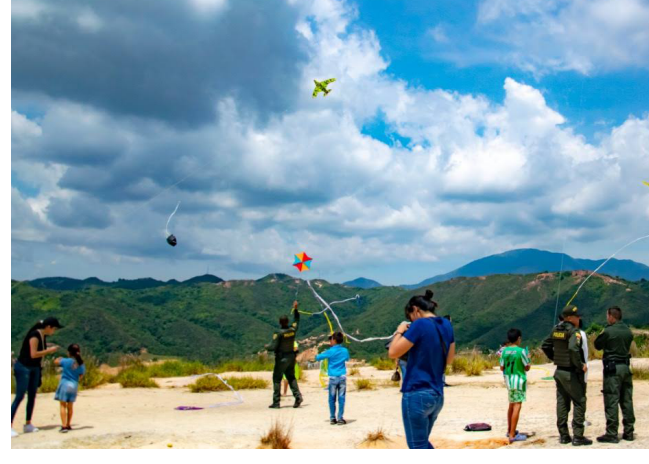
Our work supports the development of locally appropriate and inclusive mechanisms to prevent violence, Image: Oficina de Prensa UFPSO

Such activities do not just benefit the people of Ocaña. The insights gained from this project, along with numerous local participatory mechanisms our work has supported around the country, are also reflected upward to national authorities, helping Colombia to make paz territorial a reality.