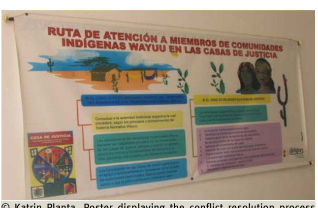
Poster displaying the conflict resolution process for the Wayuu population at the Justice House.

'preferential competence' of the indigenous authorities is recognised and the Justice House has even developed some information material to explain the conflict resolution roadmap for Wayuu communities within the House of Justice (see picture on the right), which clearly indicates the traditional authorities as the first go-to instance with regard to conflict resolution.<sup>33</sup> Palabrero organizations, however, complain that in reality, public functionaries take on the responsibility of conflicts without consulting