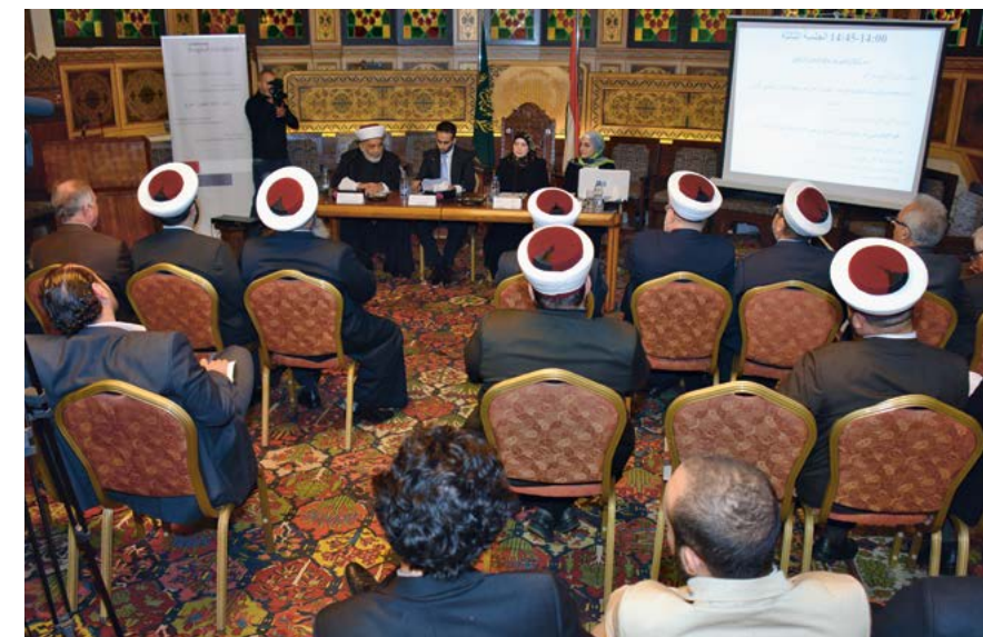
Panel at the conference on religious media in Beirut, Lebanon