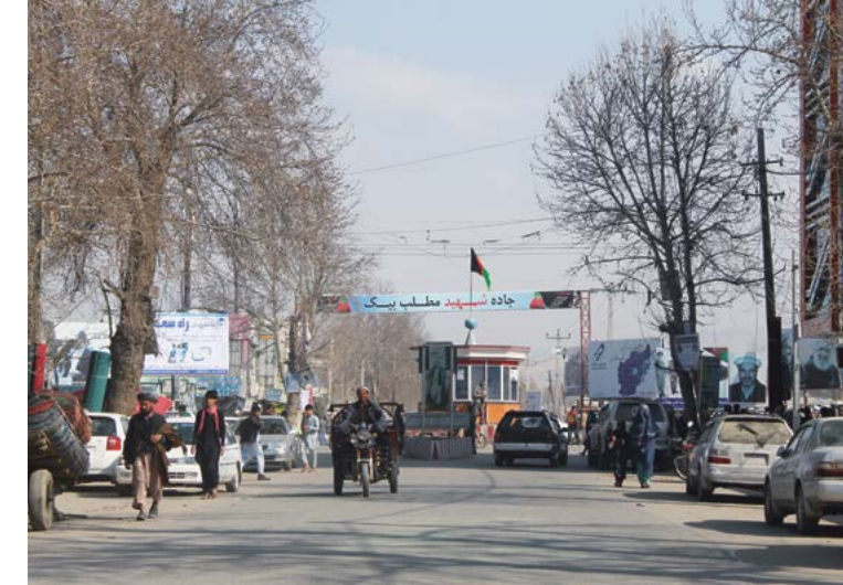
Taloqan City, the capital of Takhar Province and one of the urban research locations

Former Nepali Maoist combatant, now leader of a consumer's association