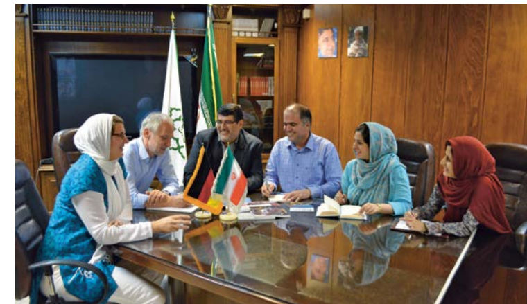
Planning discussion at the Tehran Peace Museum

In 2015, Peace Counts trainer teams organised their first independent training of trainers in Northeast India and the Caucasus under the supervision of Berghof Foundation staff. With the first joint Peace Counts training in Nagorno-Karabakh, an Armenian-Abkhaz-Georgian coaching team opened up a new area for our educational work in the Caucasus region. This unprecedented team composition showed that dialogue and cooperation are possible even under tense conditions. The local training teams reached around 1,000 people in the three target regions Iran, Caucasus and Northeast India with their work in peace education. They contributed to inspiring students and teachers, community and church leaders, ex-combatants, war widows, parents of fallen soldiers and internal refugees to strive towards peaceful and nonviolent coexistence. In addition, employees of the Berghof Foundation have developed and elaborated a Peace Counts e-learning concept. The concept was discussed during a meeting with education experts from Northeast India in Tübingen. The experts also gave valuable advice on its contextual implementation.