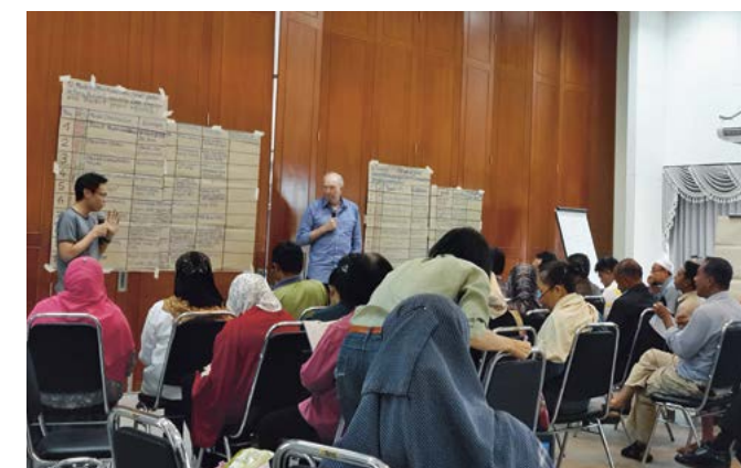
Insider Peacebuilder Platform workshop in Pat(t)ani, Thailand

Collaborative with offices in Pa(t)tani and Bangkok. Key contentious issues were identified to help generate options for compromises and to furnish ideas for confidence-building measures.