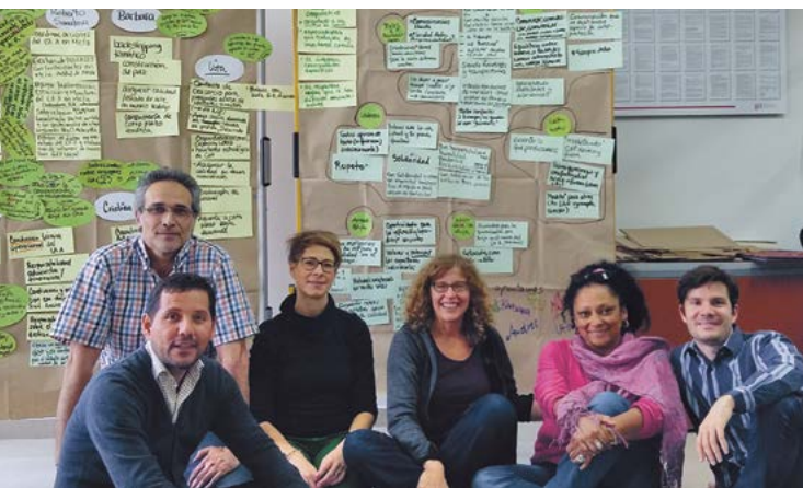
Team photo of the ProPaz components