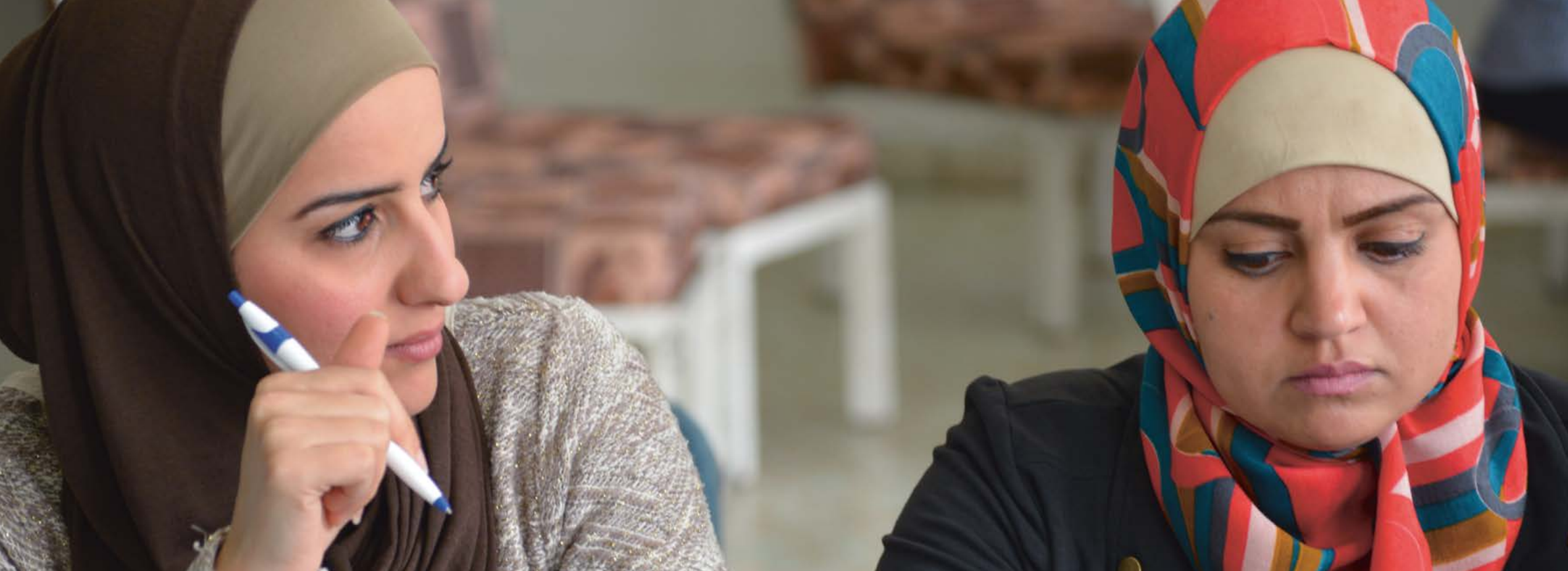
Participants at one of the Berghof Foundation's workshops in Amman, Jordan