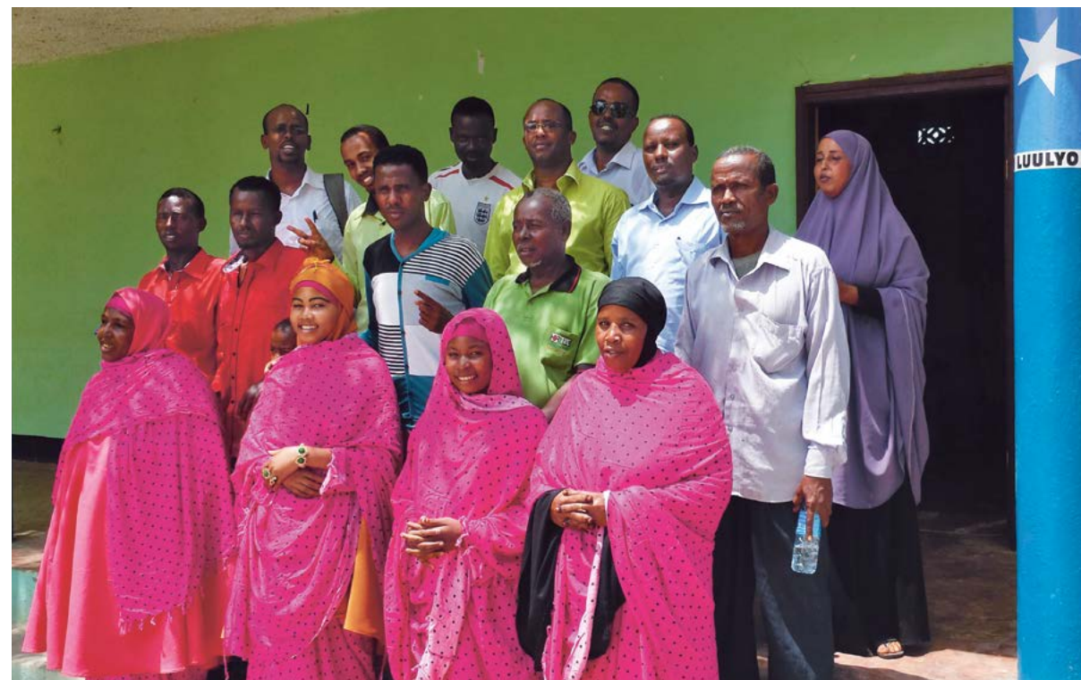
Assessment mission in Middle Shabelle, Somalia

Building on our previous engagement with Syrian civil society and humanitarian initiatives in Germany, the Berghof Foundation has participated in the Diaspora Emergency Action and Coordination initiative (DEMAC) in cooperation with the Danish Refugee Council and AFFORD in 2015. Responding to growing global needs in humanitarian action, DEMAC supports diaspora-based humanitarians to improve their emergency response and coordination with the international humanitarian system. Our engagement sought to contribute to enhancing humanitarian response capacities of Syrian relief providers in face of the limited physical presence of international aid agencies in Syria. Based on the momentum created by the World Humanitarian Summit and the growing interest in alternative ways of delivering humanitarian assistance, we explored intervention methods and organisational capacities of diaspora humanitarians and provided space for enhancing mutual understanding between diaspora and international humanitarian actors.