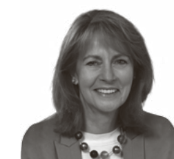
Dr. h.c. Edelgard Bulmahn Vice-President of the German parliament