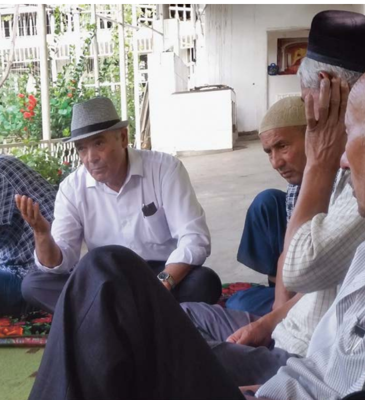
Talking with a group of elders (informal leaders) in Kara-Suu District, Kyrgyzstan

After two years of ceasefire and fragile advances in the so-called resolution process, the Turkish-Kurdish conflict escalated once again in the summer of 2015. Targeting influential actors from the socio-economic and political spheres at track 1.5, we have sought to strengthen efforts aiming at conflict de-escalation by enhancing the role of the business sector in conflict transformation, providing space for sustained dialogue, engaging with youth as drivers of constructive political change and supporting a group of influential insiders who can help build bridges across the conflict divide. In 2015, we laid the groundwork for all streams of work and will continue to deepen the engagement and over the next two years we will continue to deepen engagement with our Istanbul-based partner organisation Center for Public Policy and Democracy Studies (PODEM).