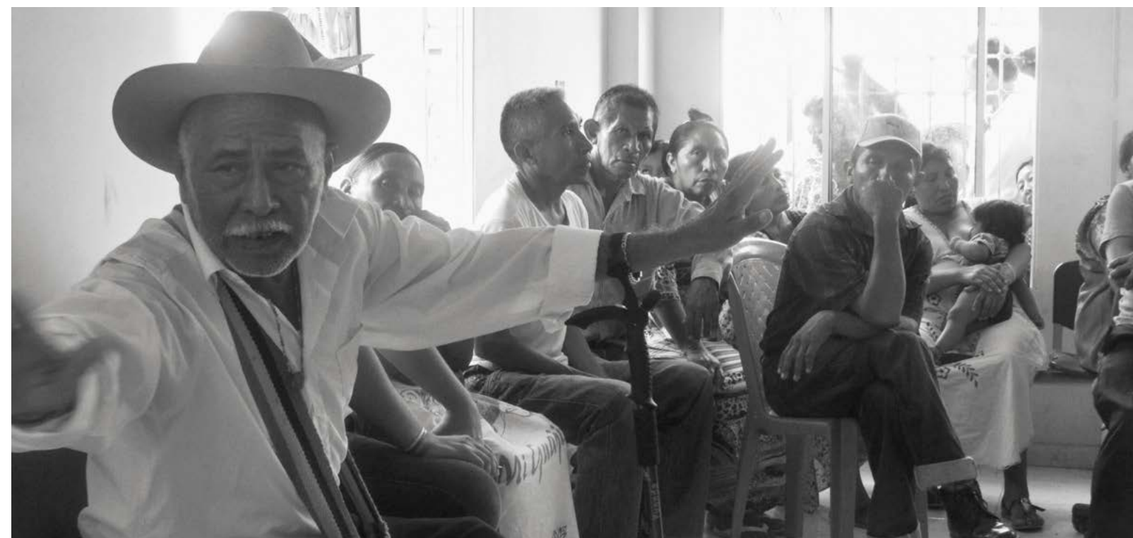
Intervention of a palabrero (speaker) in La Guajira, Colombia

As a researcher, particularly at a junior level, it is sometimes hard to see the impact of the research I am contributing to. Therefore, it is really rewarding when it does become visible, for example, when the help of our research is requested by parties to peace processes, or when some of our work is presented to policy circles.