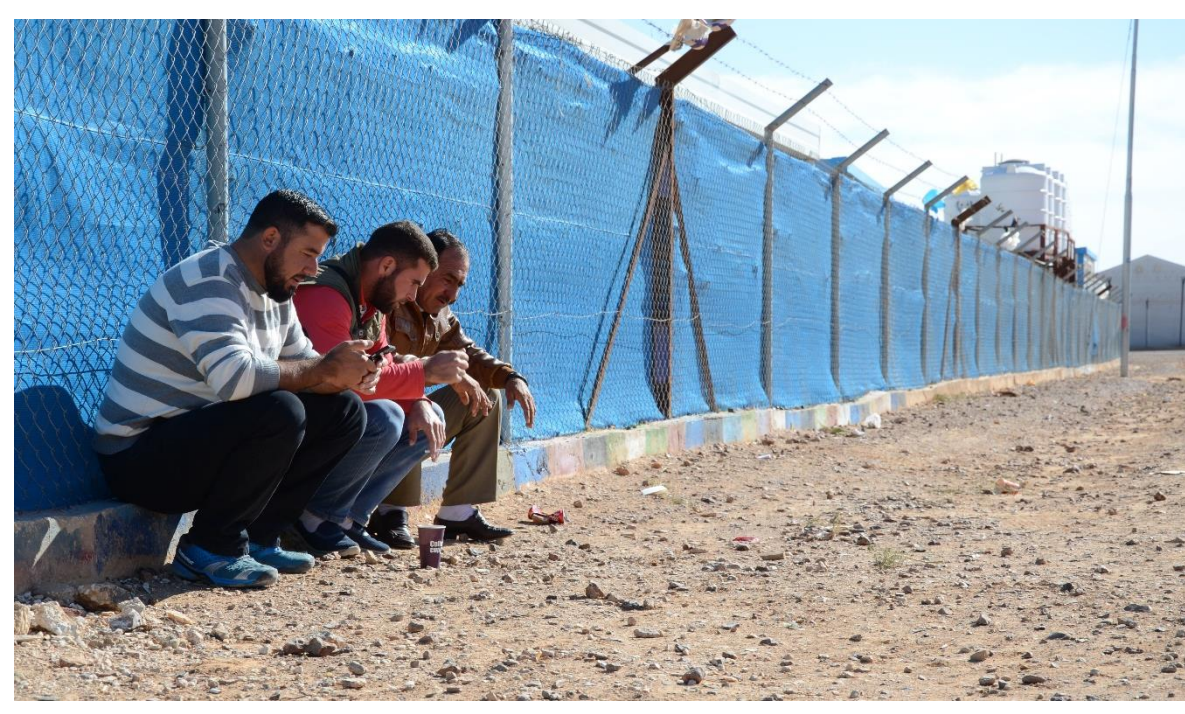
Workshop participants at Azraq refugee camp, Jordan, Image: Berghof Foundation

We will continue to build on the strength of our collaborative and participatory research methods. To support our in-country work and influence policy-making on the national and international stage, we centre our research around three thematic streams: (1) violence prevention with a focus on community resilience towards violent extremism; (2) peace process design with a focus on better understanding the conditions and effects of inclusivity and participation in peace processes; and (3) post-war reconciliation and peacebuilding with a focus on the political transformation of armed groups and the reintegration experiences of female excombatants.