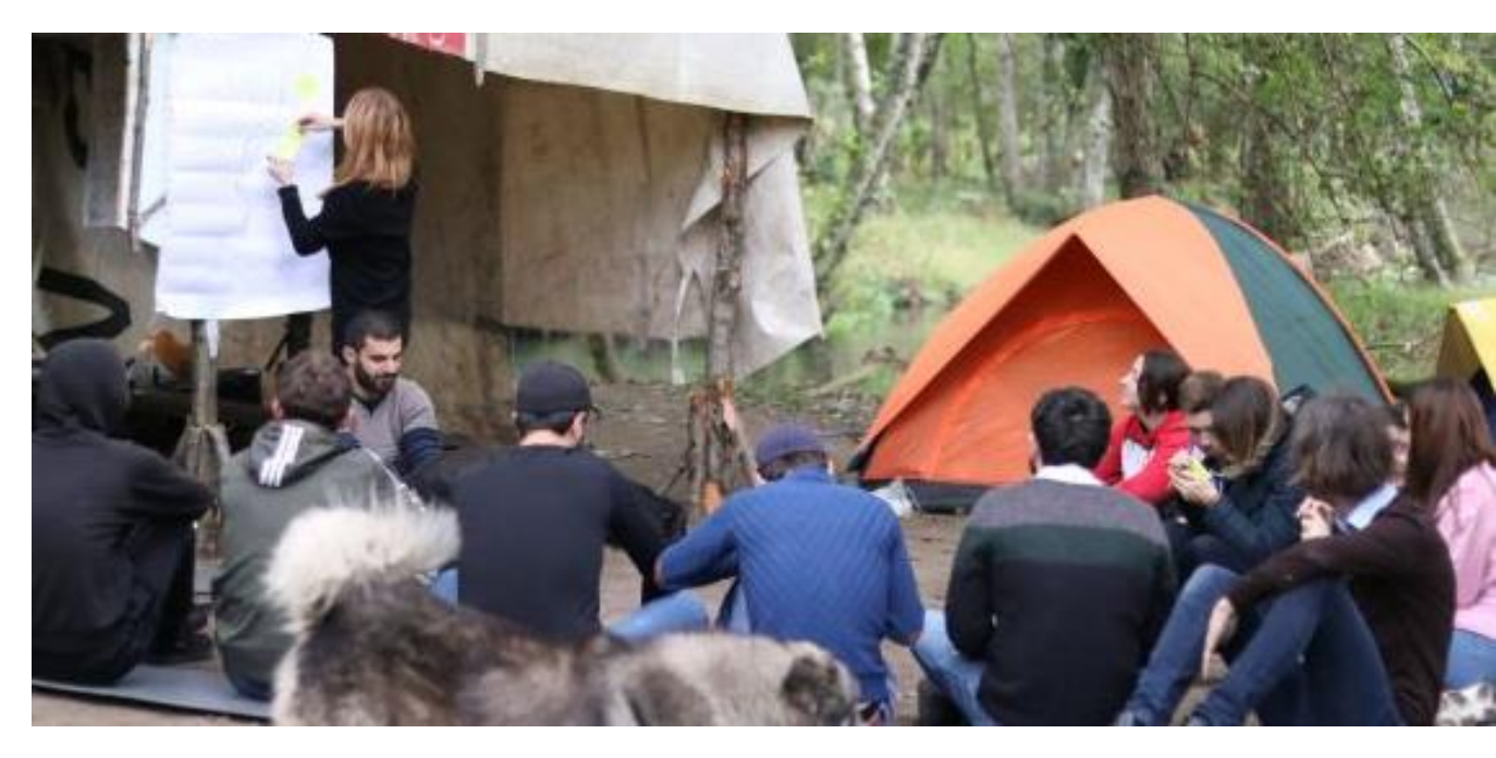
Young people coming together at the Step Forward workshop in Sukhum/I, Image: Yana Bzhania

Inclusive peace process design and mechanisms that allow for the effective participation of a broad range of actors beyond the main warring parties are needed for any peace to be sustainable. Advancing knowledge on the timing and modalities of inclusive participation in peace processes is key. We will continue our collaborative research, capacity building, policy advice and practical engagement with marginalised social sectors and 'hard-to-reach' actors, including women, armed actors, nonviolent social movements and traditional community leaders. We will also increase our work with youth with the aim of supporting more constructive engagement based on the huge untapped potential of youth.