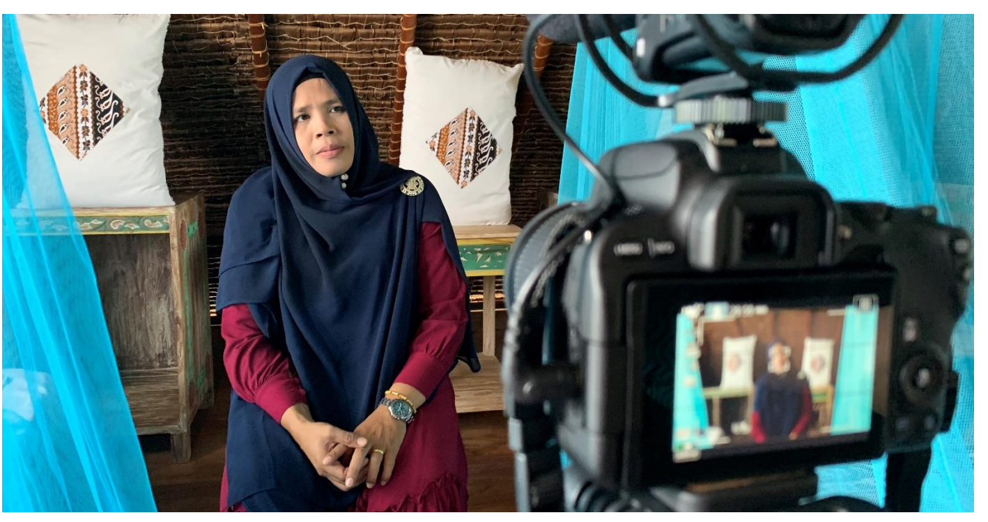
Video training with women from demobilised armed groups in Banda Aceh, Indonesia, Image: Berghof Foundation

While 2019 and 2020 have both already been dubbed as a 'year of protest', we expect that climate change, resource scarcities, inequalities, electoral fraud, police brutality, corrupt regimes, military coups, and populist appeals, will trigger the emergence of further mass mobilisations in the coming years.