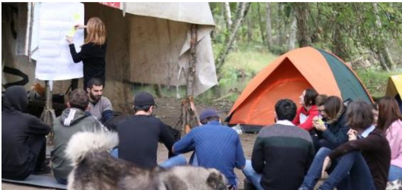
Young people coming together at the Step Forward workshop in Sukhum/I, Image: Yana Bzhania

Inclusive peace process design and mechanisms that allow for the effective participation of a broad range of actors beyond the main warring parties are needed for any peace to be sustainable. Advancing knowledge on the timing and modalities of inclusive participation in peace processes is key. We will continue our collaborative research, capacity building, policy advice and practical engagement with marginalised social sectors and ‘hard-to-reach’ actors, including women, armed actors, nonviolent social movements and traditional community leaders. We will also increase our work with youth with the aim of supporting more constructive engagement based on the huge untapped potential of youth.