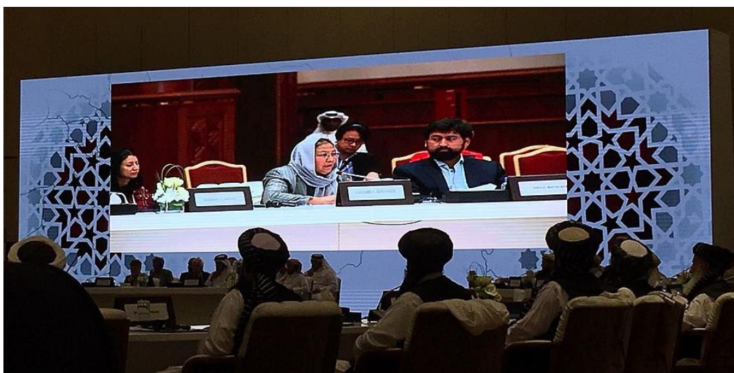
Dr. Habiba Sarābi speaking at the Intra-Afghan Conference for Peace

training and coaching of track 1 and 2 mediators, and strengthen insider mediators. We will offer policy advice on mediation and negotiation support to mediation teams and other experts, and contribute to the advancement of mediation concepts and approaches. In particular, we will address the intersection of mediation and constitution building, mediation and gender, and mediation and faith-based actors, as well as challenges in asymmetric negotiation processes.