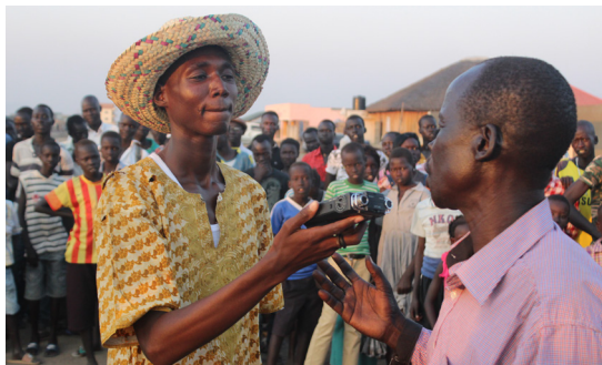
©Likikiri Collective - Theatre Season: Planting Possibilities.

As part of the Collective’s Art Program, the Theatre Season: Planting Possibilities is an annual initiative running since 2016 that combines theatrical education with civic engagement. Drawing on South Sudan’s agricultural traditions, the project is structured into three phases: Tilling the Soil, Planting the Seed, and Harvesting. The project begins with intensive workshops on theatrical techniques, followed by performances where participants receive feedback from community leaders and experts. The final phase