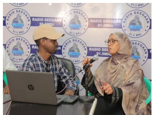
Moderator of Berghof's Galkayo radio programme Garasho-wadaag (Sharing of Knowledge) in dialogue with an expert guest during the episode 'A cleaner and healthier environment for peaceful coexistence'.