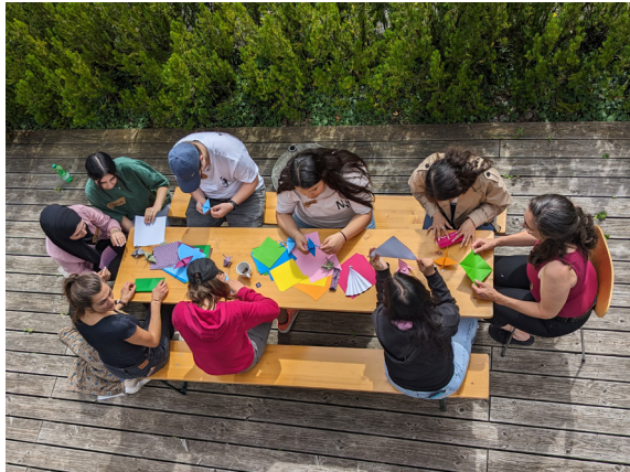
Interactive school class workshop in Germany.

The rise of conspiracy theories, hate speech, and disinformation in the digital sphere presents new threats to social cohesion. Recognizing this, Berghof has expanded its peace education work to address these phenomena, facilitating intergenerational dialogues where young people and adults discuss the impact of social media on public discourse. These initiatives promote media literacy and encourage critical thinking, helping to restore trust in information systems.