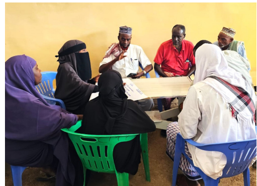
Breakout group dialogue during a Shir in Mahaday, Somalia.