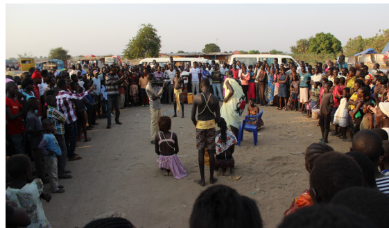
©Likikiri Collective - Theatre Season: Planting Possibilities.