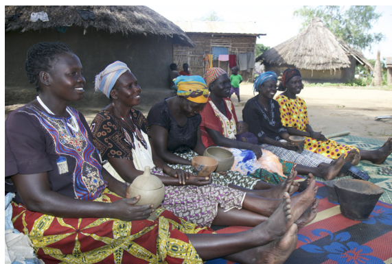
©Likikiri Collective - Art Heritage and Resilience Story Circles.