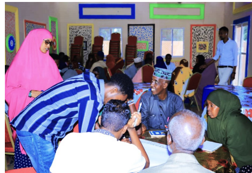
Dialogue in Adado, Somalia, among elders, women and youth, facilitated by Insider Peacebuilders Network (IPN) members.