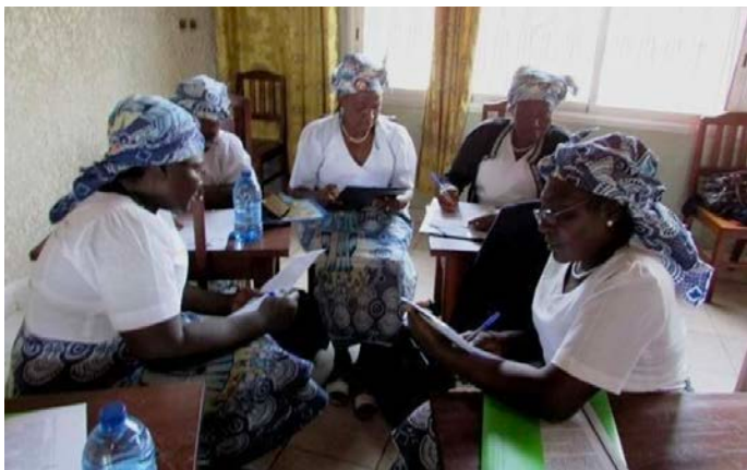
Group work with Catholic Women Organization in Cameroon.

In addition to barriers created from societal roles and norms, religious institutions, references, and fundamentalist and dogmatic interpretation of faith can further limit the role and potential of WFBMs. Faith-based institutions and structures are historically patriarchal, with very few women in official and clerical roles. These limited opportunities for women to join official structures further limits their access and ability to increase their individual faith-based knowledge and authority. 63 This is the case for almost every religious tradition with structurally defined gender roles, which add to further power imbalances between ordained male clerics and laywomen. 64 For example, the public and leading roles of female adherents of Baptist or Pentecostal churches in Cameroon are limited. These churches and faith communities and in particular female members, see their purpose in worshiping, dedicating their life to God and the faith community, and serving with humility. Leading and public roles for women are seen to be problematic within many of these societies, which results in strong social and moral pressure on WFBMs. 65