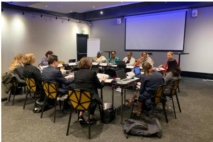
Photo: Consultation between WFBMs, Network for Religious and Traditional Peacemakers and Ministry of Foreign Affairs Finland to understand support needs of WFBMs, held in Helsinki, Finland in 2022.

negative and divisive role of religion and faith continue to dominate the popular discourse on religion, the UN General Secretary Ban Ki Moon made a critical statement in 2008 7 which highlighted that faith and religion play a vital role in transforming conflicts that helped to illuminate the constructive role of religion and faith in peacemaking. 8 Foreign policies and the broader peacebuilding community have started to integrate faith and religion more strongly into their analysis. 9 This in turn, led to increasing interest in how faith based (insider) mediators operate, what unique potentials, approaches, and tools they might offer, what challenges they may be facing, and what further support they might need, acknowledging their relevance and significance in war-to-peace transitions.