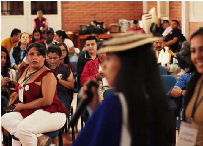
Photo: Fundación Instituto para la Construcción de la Paz, CONPAZ Encuentro Departamental Cauca, 2022.

The second overwhelming support need identified by WFBMs are support for their protection and security measures. WFBMs employ a wide range of security measures to safeguard their risky tasks. While some WFBMs receive support from organizations that track them in insecure areas, many lack secure transportation, communication and information gathering mechanisms. 119 WFBMs are taking big risks when engaging with armed groups. The security of WFBMs can be increased if they are provided with secure means of transportation and communication. Security protocols and mappings should also be shared with WFBMs working in a particular area to assess the security engagement when engaging with difficult actors. WFBMs should also have the opportunity to be trained in communication techniques for safely and effectively negotiating. The choice of the right words can be very crucial, since, ‘One wrong word, and they might seriously harm you.’ 120