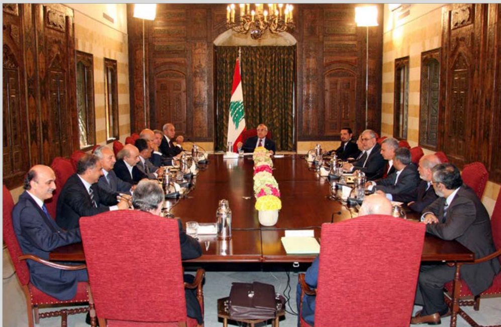
Photo: National Dialogue, Beiteddine Palace, 15 April 2010