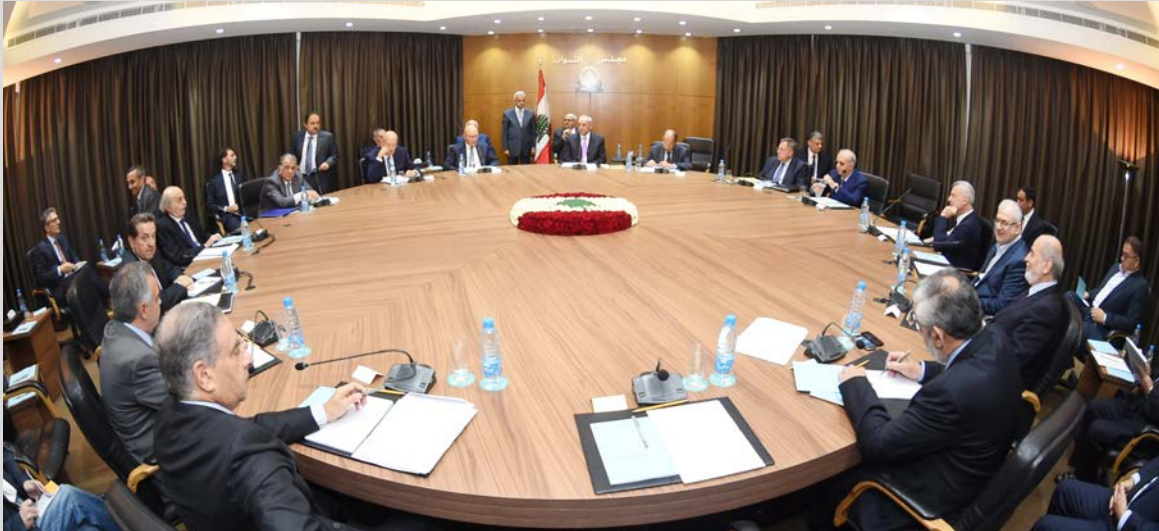
Photo: Dialogue meeting, Lebanese Parliament, 9 September 2015