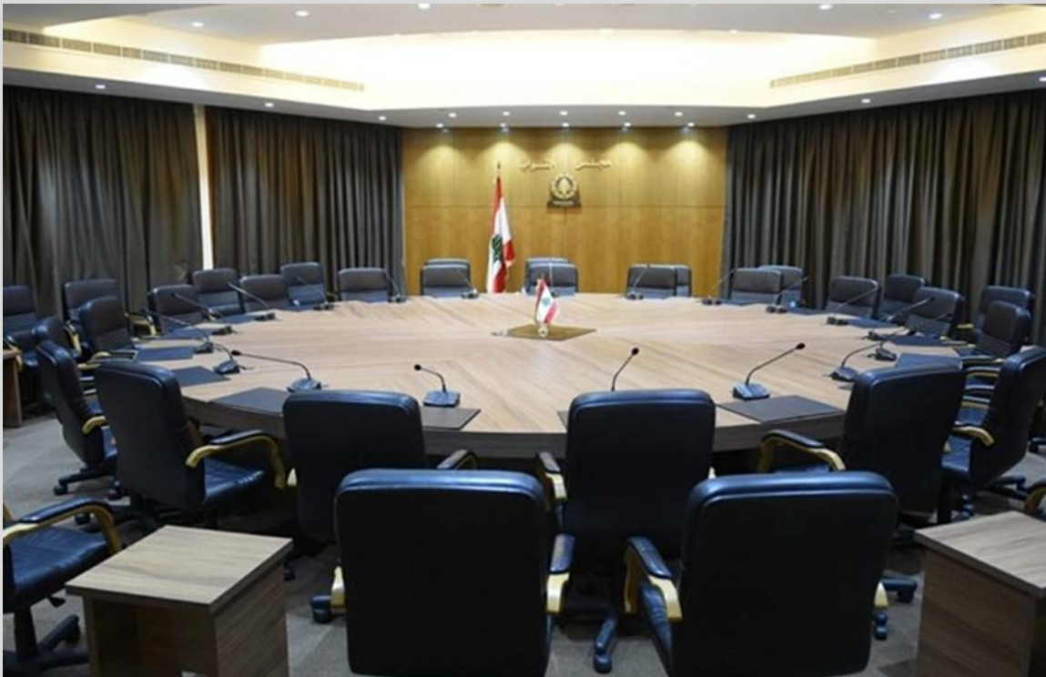
Photo: Dialogue table, Lebanese Parliament