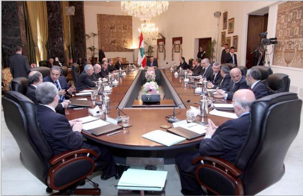
Photo: National Dialogue, Baabda Palace, 15 April 2010