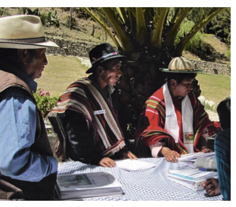
A workshop with indigenous leaders.

Armed social violence marks all Latin American countries, most notably Mexico and the states of Central America. In Colombia, peace negotiations with one of the two armed power contenders are underway and the country is preparing for a post-agreement phase. Our Latin America programme helps build spaces for conflict transformation by supporting key actors in their respective realms, fostering dialogue capacities and (infra-)structures for peace, and offering conceptual contributions on violence and its prevention. Other key aspects are sharing lessons learned and developing capacities and mechanisms for peacebuilding. We also trained dialogue practitioners in Colombia and insider peacebuilders in Bolivia, enhancing personal and organisational capacities in dialogue and mediation.