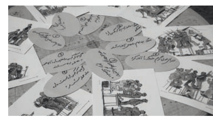
Visual material for a workshop in Afghanistan.

With almost half of Yemen's population under the age of 15 and another third aged 15 to 29, youth are particularly affected by the conflict, hindering participation in elections and local government and in turn resulting in the youth's increased isolation from the state. In this 18-month programme, young men and women in the governorates of Abyan and Al Bayda founded a Youth Council Initiative for Peace which interacts with the district local councils and tribal leadership to advocate for local youth issues. It also provides training in conflict prevention and problem-solving, serves as a peer-to-peer conflict mediator among youth and hosts a range of community activities such as soccer tournaments or street renovation projects.