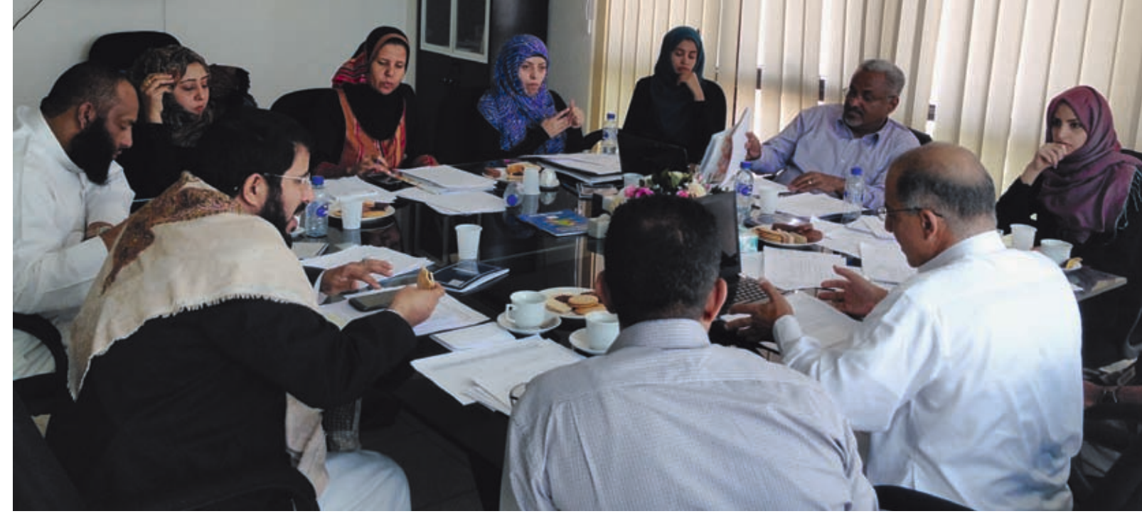
A focus group meeting for the National Dialogue Support Programme in Sana'a, Yemen.

In 2014, the government of Sudan and major opposition parties agreed to engage in National Dialogue. To assist the inception of a National Dialogue and reconciliation process, we were requested to facilitate creating space for political actors to discuss and explore a common ground. Our project worked with key stakeholders on addressing potential gaps in these processes. We also helped create an informal coalition of relevant international partners to bolster the support and incentive for such a process, and explored creative solutions to potential obstacles for Sudan and the international community.