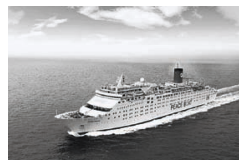
The Peace Boat.

For several years running, our team has been organising study trips with the Japanese cruise ship Peace Boat. Our participants are students of the University of Tübingen. They travel to various conflict regions and engage in constructive dialogue with their fellow travellers, local peace activists and international experts to gain firsthand knowledge of conflicts and peacebuilding. They also share their experience as Germans dealing with their own violent past aboard this floating peace university.