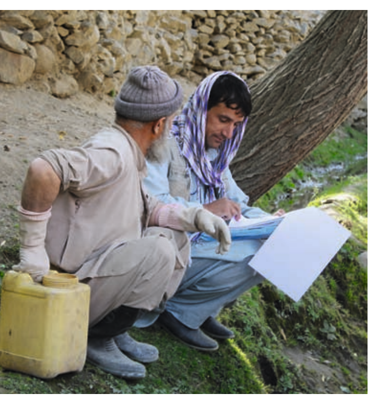
A local enumerator interviewing a farmer in the Takhar Province of Northeast Afghanistan.

This programme builds upon our long-standing experience in participatory research and capacity-building engagement with civil-society actors and resistance and liberation movements in war-affected or post-war regions. Its central aim is to support the active participation of conflict stakeholders, both armed and unarmed, in inclusive processes of nonviolent resistance and conflict transformation. It also seeks to provide policy advice to international and state agencies on options for supporting these peace- and state-building agents in asymmetric state-society conflicts.