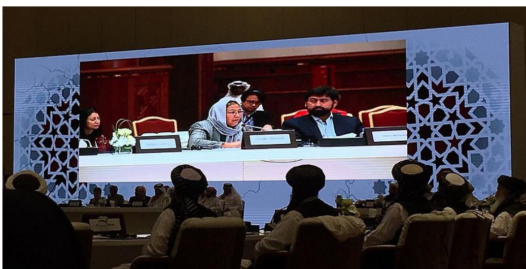
Dr. Habiba Sarābi speaking at the Intra-Afghan Conference for Peace, Image: Berghof Foundation

Informal high-level dialogues are increasingly recognised by state actors as a useful tool to generate new ideas for solving complex conflicts. They can provide flexible and complementary support to official peace negotiations, and help conflicting parties and communities to re-establish communication and trust.