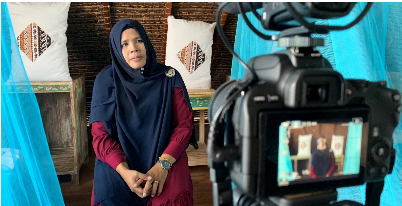
Video training with women from demobilised armed groups in Banda Aceh, Indonesia, Image: Berghof Foundation

While 2019 and 2020 have both already been dubbed as a ‘year of protest’, we expect that climate change, resource scarcities, inequalities, electoral fraud, police brutality, corrupt regimes, military coups, and populist appeals, will trigger the emergence of further mass mobilisations in the coming years.