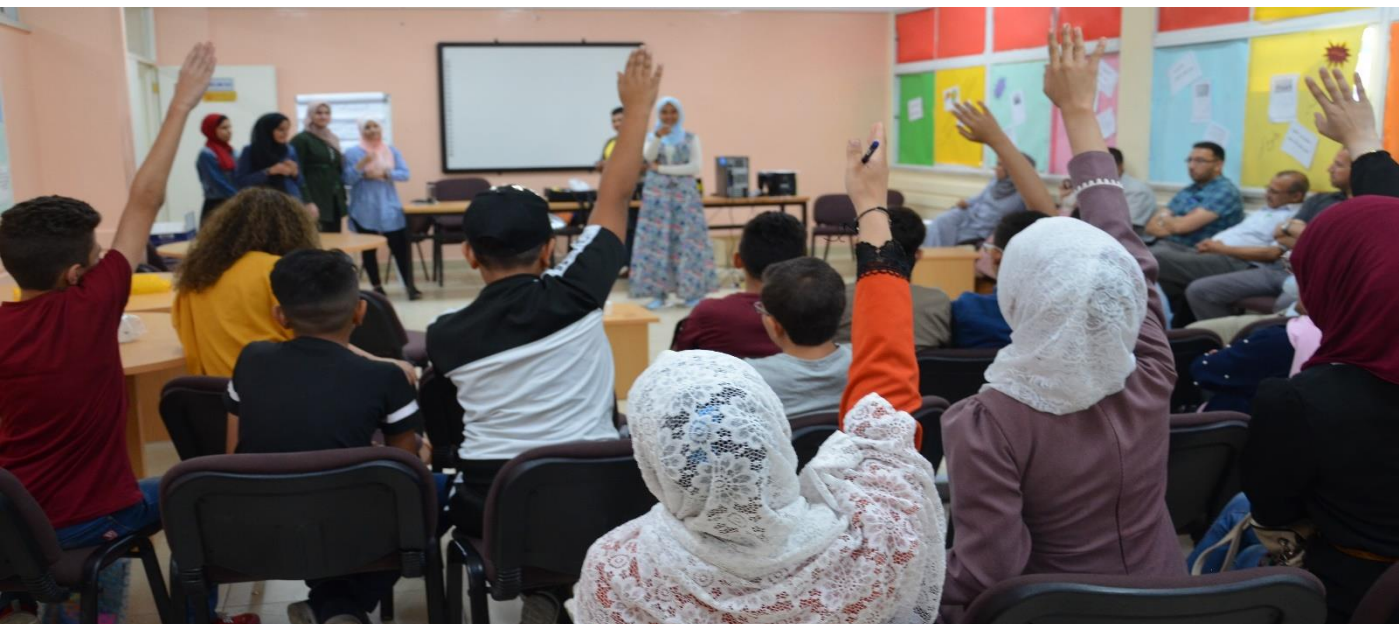
Peace Education Summer Camp in Jordan

In a world of growing uncertainty, people's need for orientation is increasing. We provide inspiration and settings for joint learning processes based on our conviction that learning