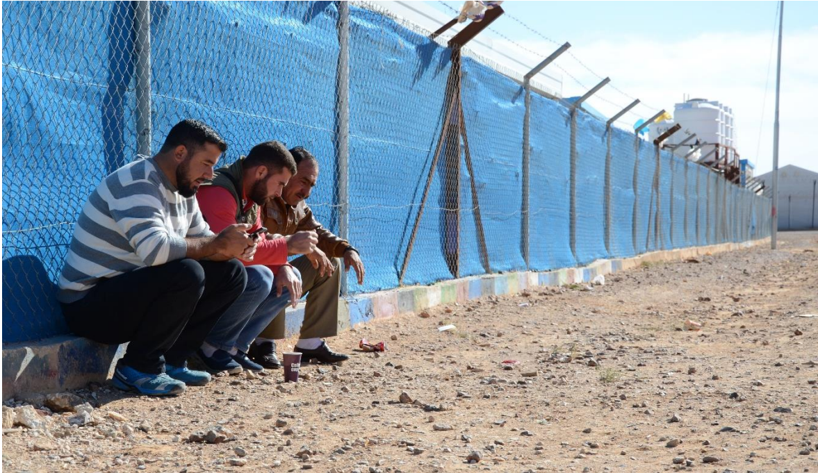
Workshop participants at Azraq refugee camp, Jordan, Image: Berghof Foundation

We will continue to build on the strength of our collaborative and participatory research methods. To support our in-country work and influence policy-making on the national and international stage, we centre our research around three thematic streams: (1) violence prevention with a focus on community resilience towards violent extremism; (2) peace process design with a focus on better understanding the conditions and effects of inclusivity and participation in peace processes; and (3) post-war reconciliation and peacebuilding with a focus on the political transformation of armed groups and the reintegration experiences of female ex-combatants.