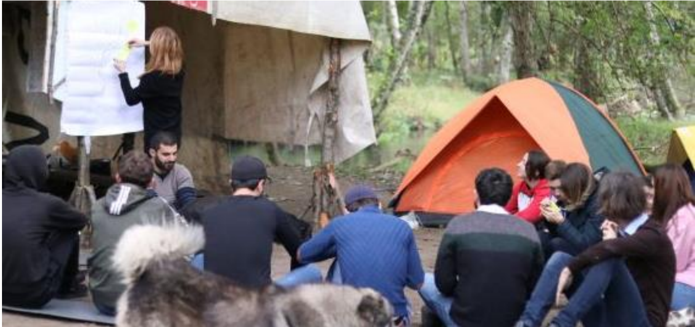
Young people coming together at the Step Forward workshop in Sukhum/I, Image: Yana Bzhania

We will also increase our work with youth with the aim of supporting more constructive engagement based on the huge untapped potential of youth.